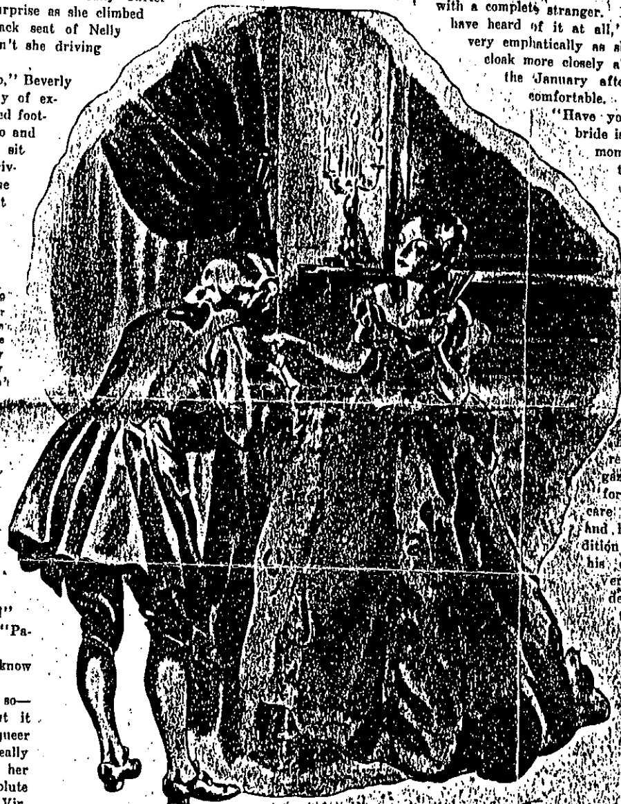
And when the bride finally presented her cousin, he bent and kissed her hand

And what I wouldn't give to possess one of these gilt-edged invitations to the reception at that very White House this evening!" Beverly sighed as she leaned back