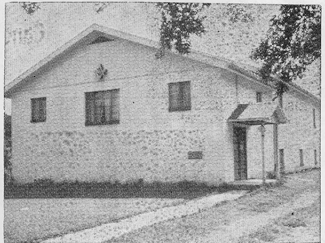
The Masonic Temple , home of A.F.&A.M., Royal Arch Chapter and Eastern Star Lodges.