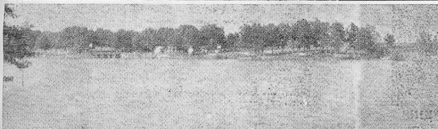
This Lake Scene made from the west shore facing east. The bridge at the dam, the point by the north shelter house, are in the background.