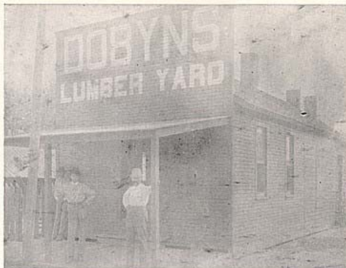
This is the Dobyys Lumber Co., as it appeared in 1905. The building stood just where the one today does.

The Centennial Association deeply regrets this omission, but in order to get the book completed by the opening of the Centennial, it was necessary to go to press without delay.