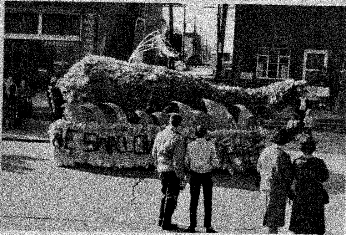
WHALE WITH A MOUTHFULL: The prize winning homecoming parade float designed and constructed by the Senior Class, depicts a large whale, such as the one that must have swallowed Jonah. This whale however, has swallowed a football player, and only the feet with football shoes are sticking out from the whale's mouth. The caption and theme of the float is: "We swallow all but de-feet".