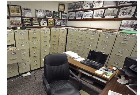
Ready and waiting

SHELBY COUNTY HISTORICAL SOCIETY, INC P O Box 245 Museum at 107 S Center Street Library at 109 S Center Street Shelbina, MO 63468-0245 Established 1963 573.588.0245 (local) Kathleen Wilham - Curator 573.406.8589