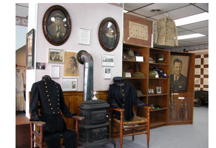
Might be updated